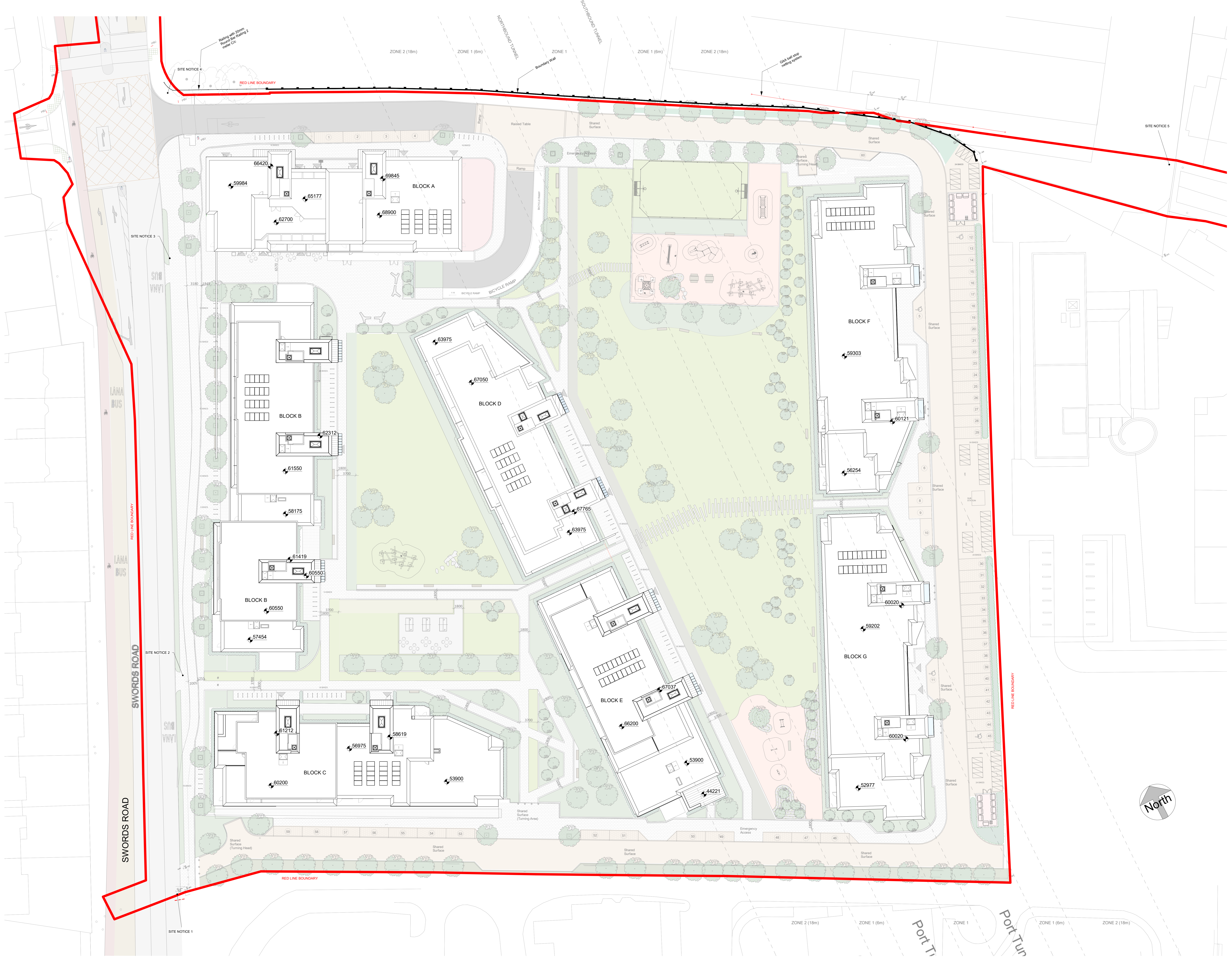
1 ROOF PLAN 1:250